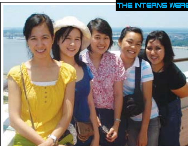
THE INTERNS WERE: